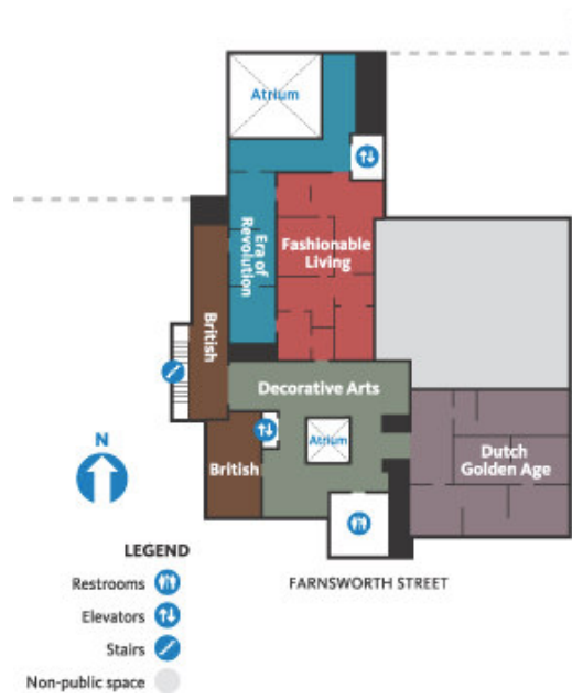
Figure 3 Top Floor: