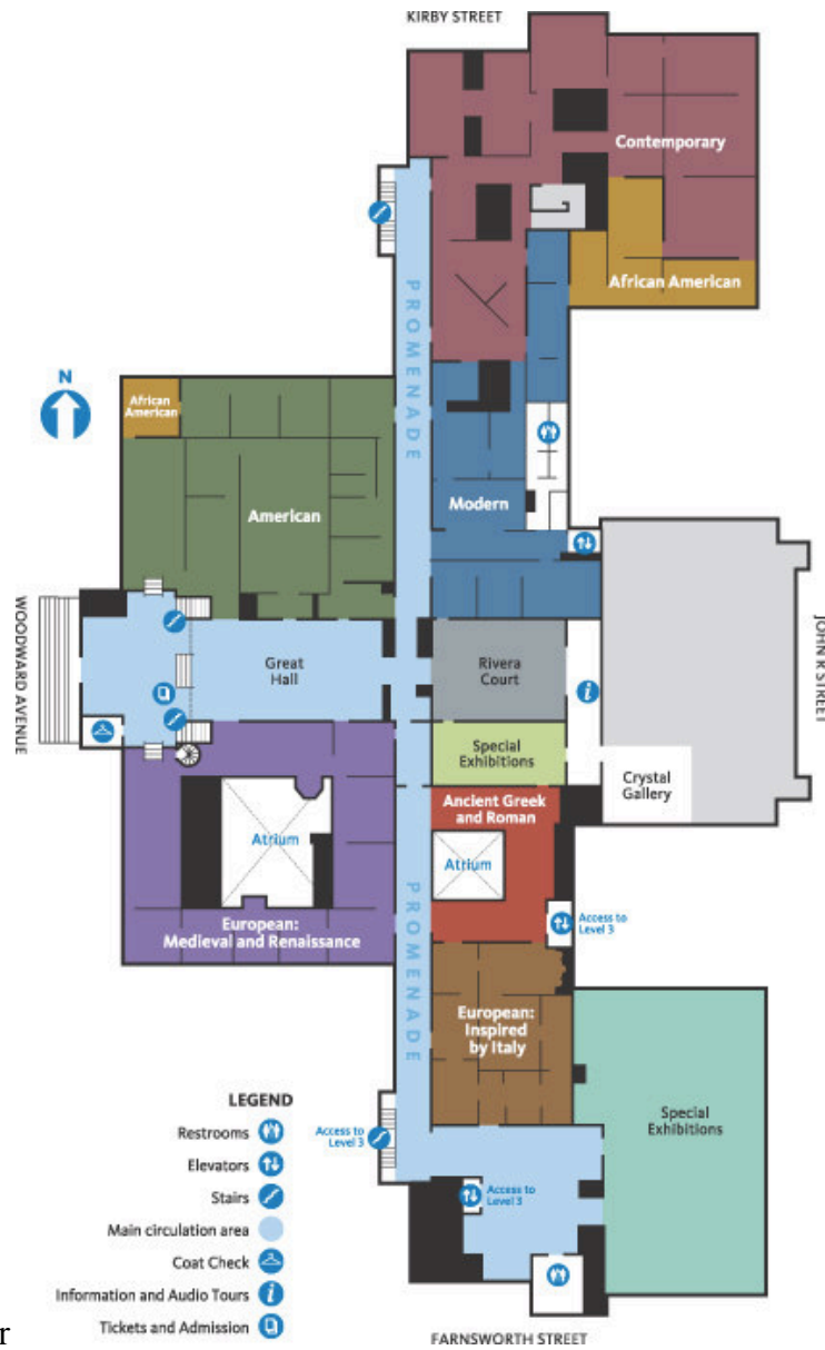
FIGURE 1 Main Floor