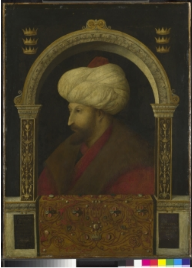
Figure 4. Gentile Bellini, Portrait of the Sultan Mehmet II , 1480; oil on canvas. National Gallery, London.

When drawing out evidence of figural representation in Islamic art it is essential to recognize that the form and content of these images are linked to the societies for which they were created (and not necessarily a faithful record of what has been seen and experienced). As art historian Eva Baer emphasizes, different periods of Islamic history did not have the same standards or ideas about the representation of the human image. cci Despite the “predilection of Muslim artists for abstract designs and their tendency to